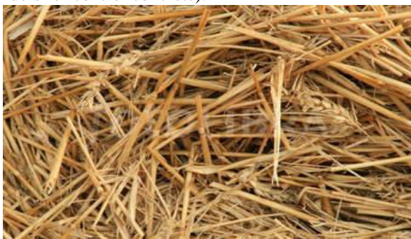
Fig.(2) Wheat Straw Fiber

For compressive strength, concrete cubes of 150 mm dimensions, were used. While for tensile strength, cylinder molds of diameter 150 mm and height about 300 mm were prepared for splitting test. Concrete curing was taking place, for a period of 7 days and 28 days before test. Three specimens for each test were casted (three cubes and three cylinders for control concrete).