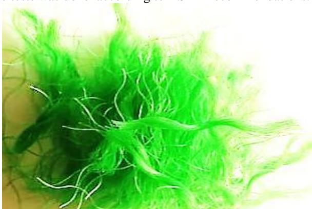
Fig.(1) Plastic Fiber

The tests were done according to ASTM recommendations.