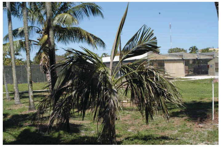
Figure 5. Boron deficient kentia palm.

Controlled-release fertilizer having an N:P<sub>2</sub>O<sub>5</sub>:K<sub>2</sub>O ratio of approximately 3:1:2 results in the greatest growth in container-grown plants. However, in Florida landscapes fertilizers having an analysis of 8-2-12-4Mg plus micronutrients are recommended for this species. See "Nutrition and Fertilization of Palms in Containers" (http://www.edis. ifas.ufl.edu/ep262) and "Fertilization of Field-Grown and Landscape Palms in Florida" (http://www.edis.ifas.ufl.edu/ ep261) for more information about fertilizing palms.