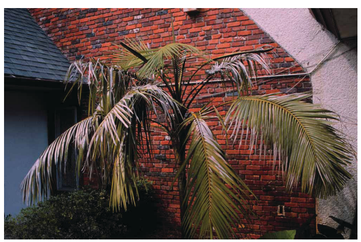
Figure 4. Manganese deficient kentia palm.

Kentia palms also are known to exhibit symptoms of manganese (Mn) deficiency (http://www.edis.ifas.ufl.edu/ ep297) under alkaline soil conditions in southern Florida. Manganese-deficient palms have leaflet tip necrosis on the basal leaflets of the youngest leaves (Figure 4). Boron (B) deficiency (http://www.edis.ifas.ufl.edu/ep264), which can cause stunting and distortion of newly emerging leaves, incomplete opening of new leaves, or even horizontal shoot growth, also can be a problem on this species (Figure 5).