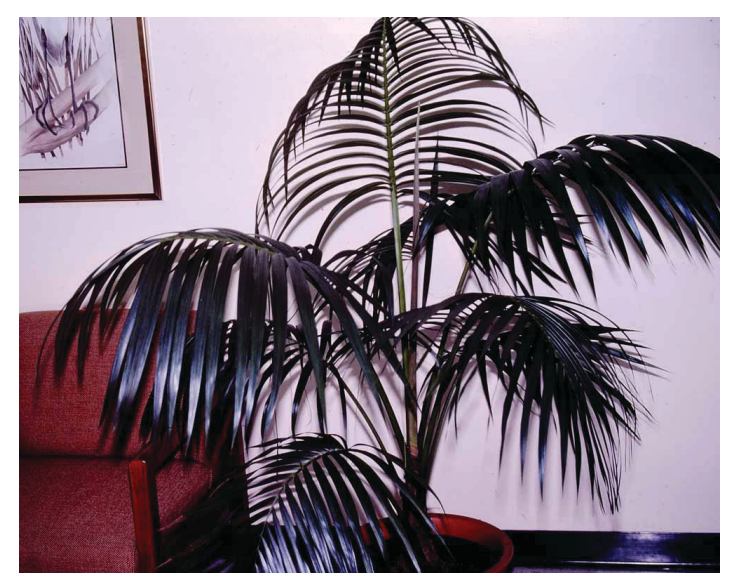
Figure 2. Juvenile kentia palm used in the interiorscape.

Potassium (K) deficiency (http://www.edis.ifas.ufl.edu/ ep269) is a serious problem on most species of palms, including kentia palms. Symptoms appear on leaflets of the oldest leaves as marginal or tip necrosis with little or no yellowish spotting present (Figure 3). Symptoms are most severe toward the tips of those leaves. Applications of controlled-release K sources are much more effective than the easily leached water-soluble K sources.