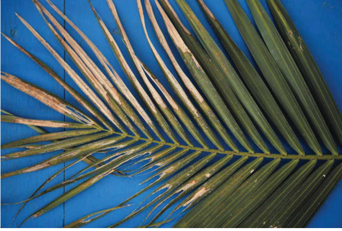
Figure 3. Potassium deficient older leaf of kentia palm showing leaflet tip necrosis.

Potassium (K) deficiency (http://www.edis.ifas.ufl.edu/ ep269) is a serious problem on most species of palms, including kentia palms. Symptoms appear on leaflets of the oldest leaves as marginal or tip necrosis with little or no yellowish spotting present (Figure 3). Symptoms are most severe toward the tips of those leaves. Applications of controlled-release K sources are much more effective than the easily leached water-soluble K sources.