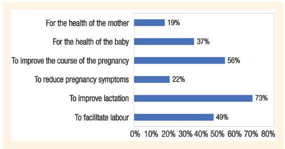
Figure 3: Reasons for herbal medicine use during pregnancy among women attending outpatient clinics in Hail, Saudi Arabia (n = 294)^* .

*Percentages do not add up to 100% as respondents were permitted to select more than one risk.