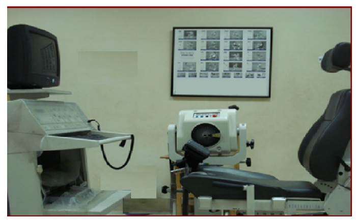
Figure 2: Biodex isokinetic dynamometer.

5. Stabilization was conducted by using straps provided on chair to prevent accessory movements of the segments.